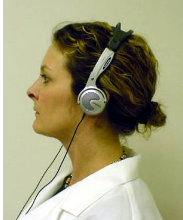
Figure 5. Cat. No. 718-0405 Over-the-head style headphones with external volume control.

These headphones are designed for use with the E-Scope Belt model, cat. no. 718-7710