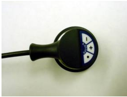
Figure 8 E-Scope Stethoscope head

The E-Scope volume may be increased or decreased by momentarily pressing the + or – button located on the stethoscope head. Pressing and holding one of these buttons for more than one second causes the volume to move up or down. It takes about two and a half seconds for this automatic adjustment to cover the full volume range of 32 steps. The E-Scope retains the last volume setting and reverts to that setting when the power is turned on.