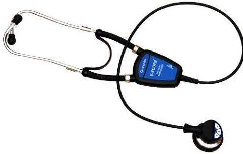
Figure 1 E-Scope II Electronic Stethoscope Clinical model

E-Scope II, models include the clinical E-Scope (cat. no., 718-7700) and the belt model E-Scope for hearing impaired users (cat. no., 718-7710).