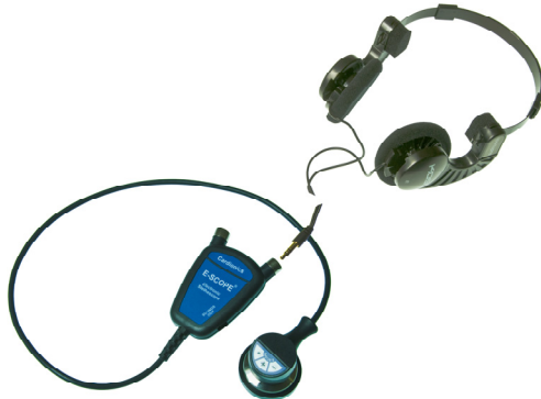
Figure 2 E-Scope belt model for hearing impaired users With Convertible style headphones