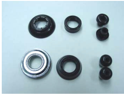
Figure 7 Accessory Pack Supplied with all E-Scopes

Each E-Scope is supplied with an Accessory pack that contains a pediatric diaphragm, plastic adult bell, plastic pediatric bell and plastic infant bell. These chest pieces can be used by replacing the existing chest piece by unscrewing. Additionally, this pack contains both mushroom and hard plastic ear tips. Inserting the mushroom ear tips will require a little force. The hard plastic eartips are self-threading. Place this eartip on the stethoscope binaural, press and with a twisting motion, screw them on.