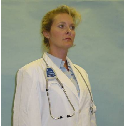
Figure 4 – Using the E-Scope